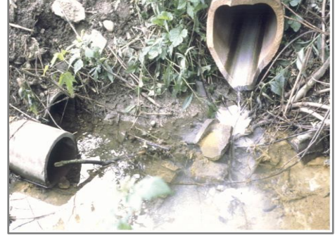
Don't discharge your power washing wastewater directly into a creek, river or other waters of the state unless you have a permit for the discharge.

If you cannot find a local POTW that will accept your wastewater, you can arrange for disposal at an industrial waste disposal facility. Some of these facilities specialize in handing industrial wastewater. Check your local telephone directory or perform an internet search for a listing of "industrial waste management" companies.