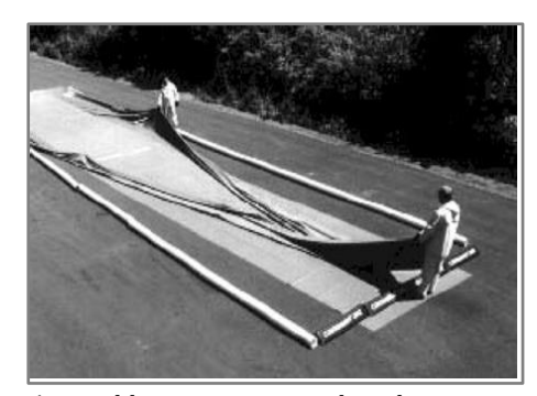
A portable containment pad can be constructed to collect wastewater from power washing.

• Depending on the volume of water generated, pump systems may range from a wet-dry vacuum to a sump pump. You can create a natural catch basin to pump water from by setting up your containment system in an area that is slightly sloped. You need to ensure, however, that water does not wash over the berms.