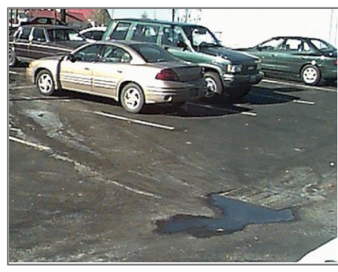
Drains in parking lots usually lead to storm sewers. You CANNOT discharge your power washing wastewater into a storm sewer.

If you locate a sanitary sewer, you must request authorization from the POTW to discharge wastewater from the job site into the sewer. A large wastewater treatment plant may have no problem handling the wastewater from your power washing activities. However, wastewater treatment plants are designed to handle sewage, not industrial wastes containing chemicals, metals, oils, etc. It is important that they know what you are discharging and when the discharge will occur. Smaller treatment plants may have additional requirements for you to follow.