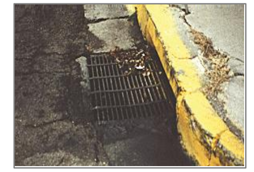
Don't discharge your power washing wastewater into storm drains. This could lead to violations and penalties.

Several options for handling wastewater are available to your company. Some options might be more practical than others and will depend on the characteristics of the individual job site. If you have any questions about managing wastewater, you should discuss your options with Ohio EPA BEFORE you begin working at a site.